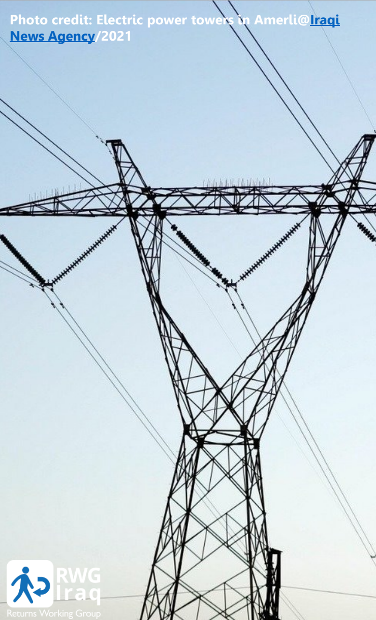
Electric power towers in Amerli

All KIs reported that the majority of households faced challenges in accessing public services. The most reported basic public service households had challenges in accessing was water , followed by healthcare.